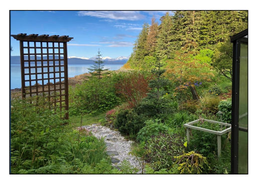
View from the Jensen-Olson Arboretum