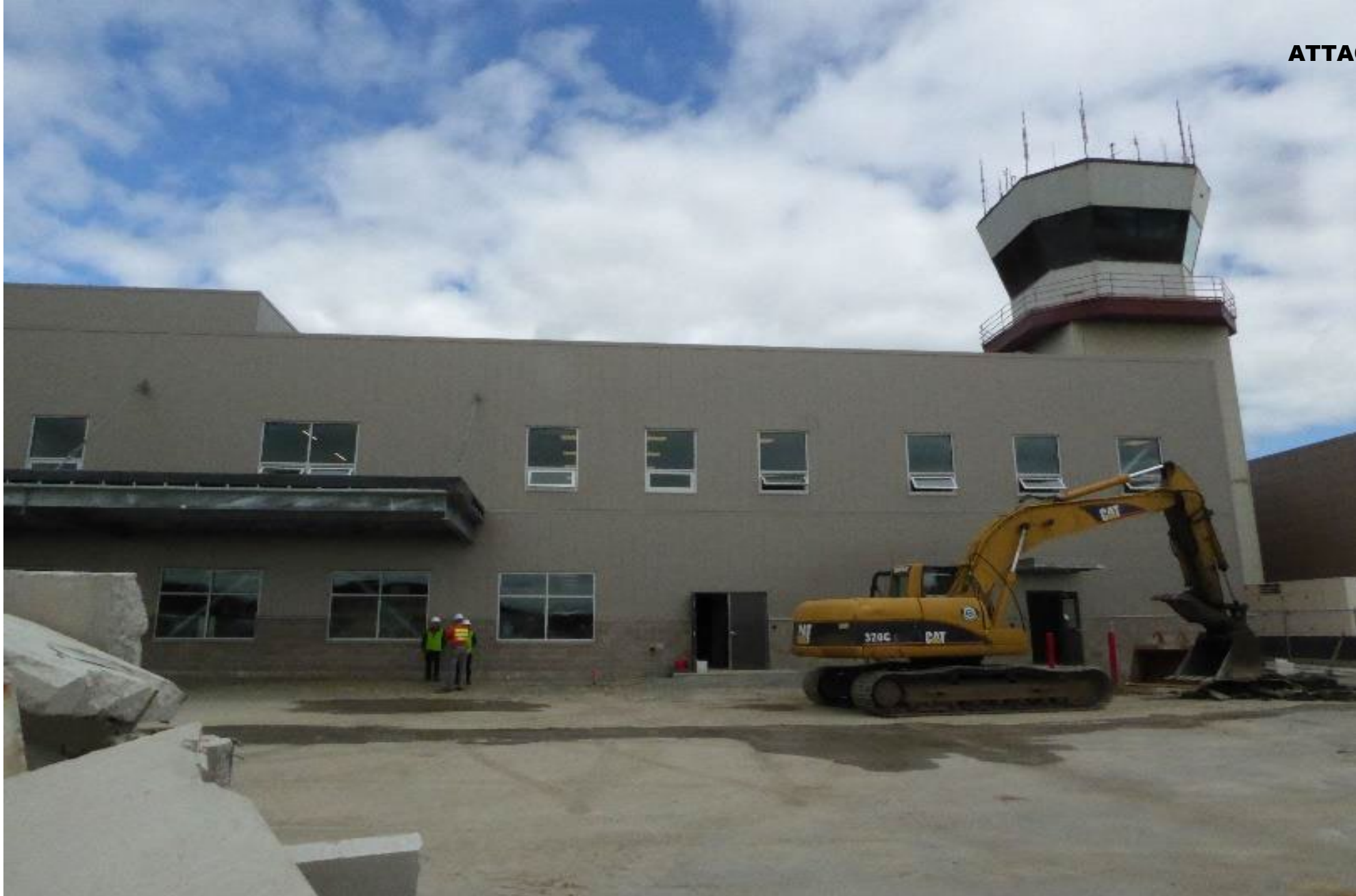
Excavation for ramp paving along west (airfield/ramp) side of building.