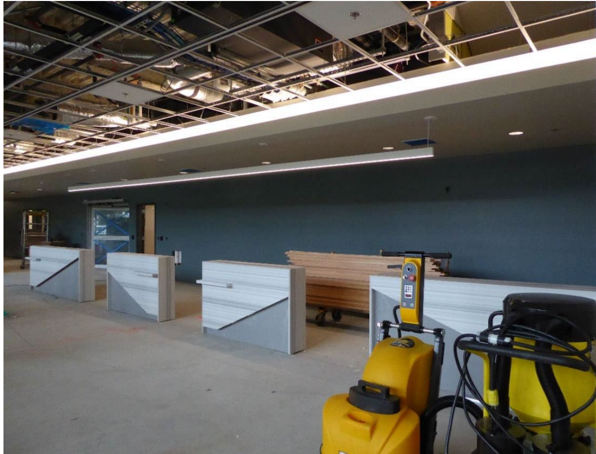
Casework fronts installed to receive tenant furnished ticket counters behind.