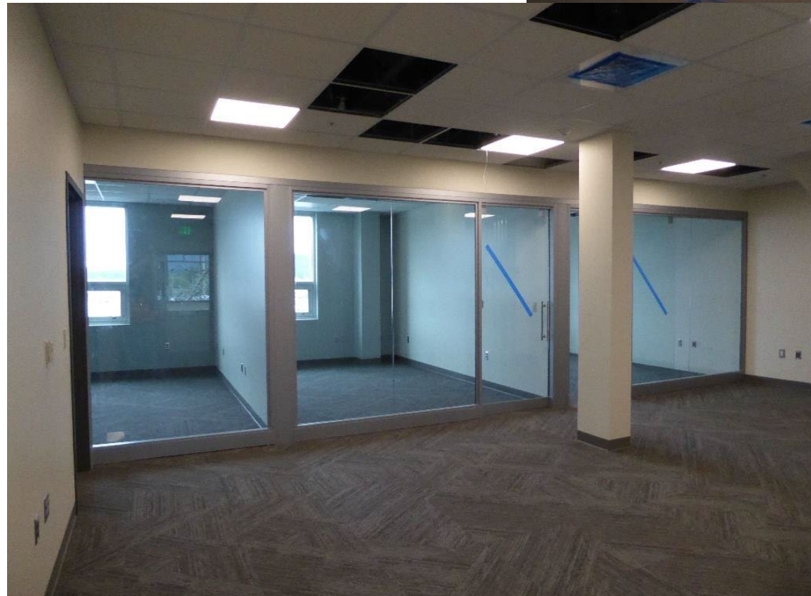
Airport Admin project office with glass partitioned offices beyond. Allows natural light into inner admin hallway, rooms.