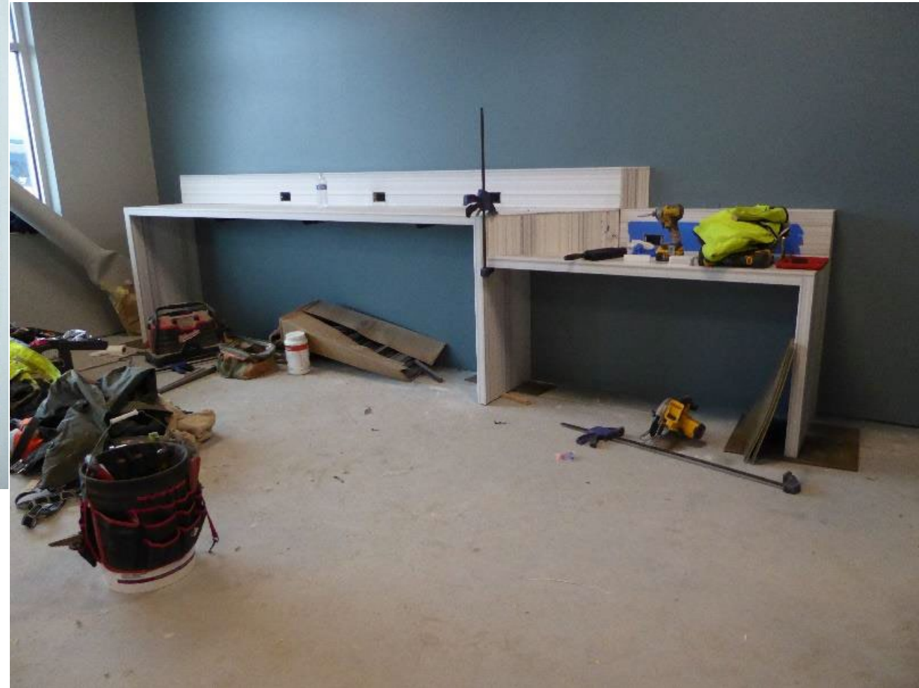
Lap top counter installation in process in seating area.