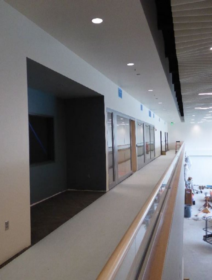
Balcony w/ wood & glass railing installed; admin suites off balcony.