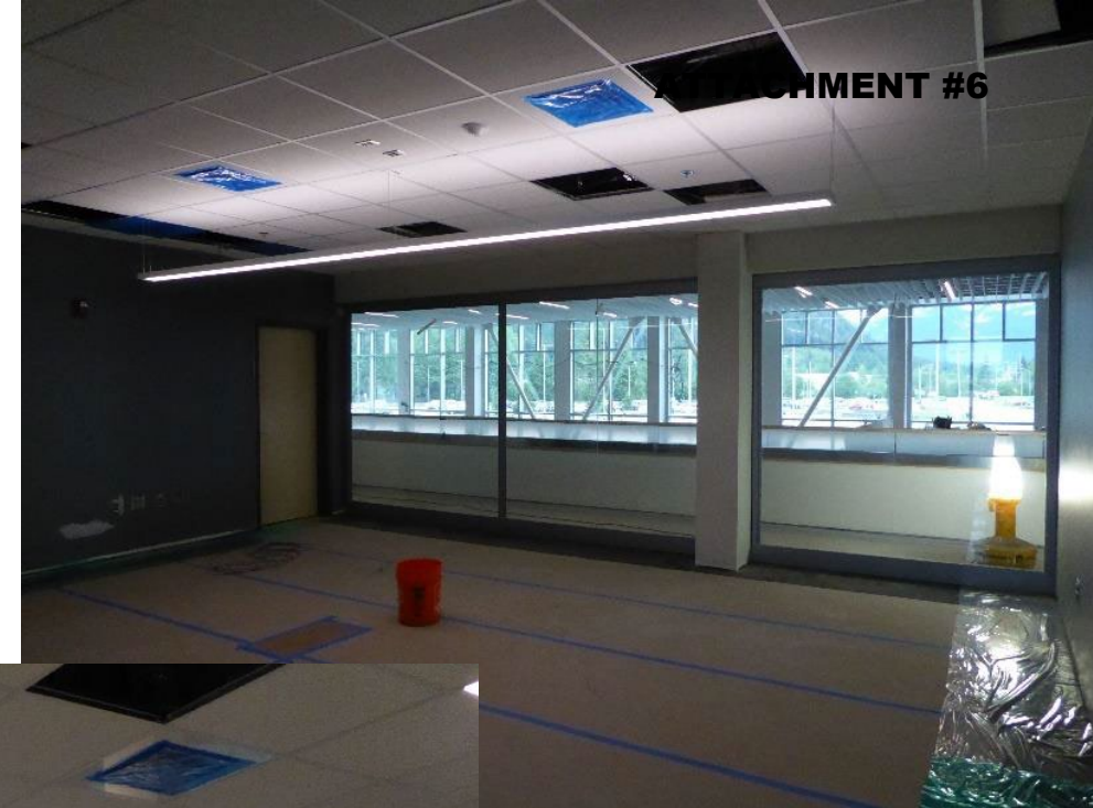
Airport Admin conference room looking out toward balcony.