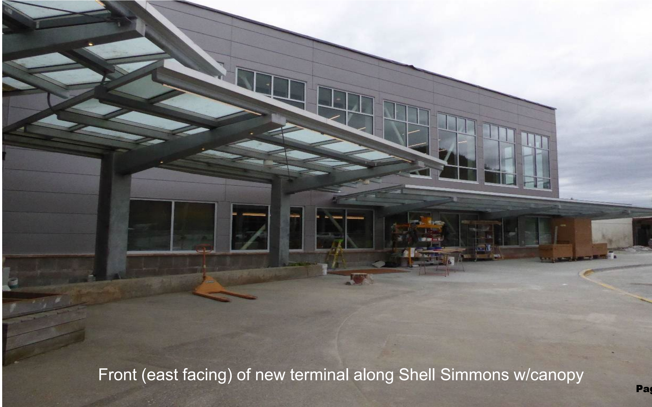
Front (east facing) of new terminal along Shell Simmons w/canopy