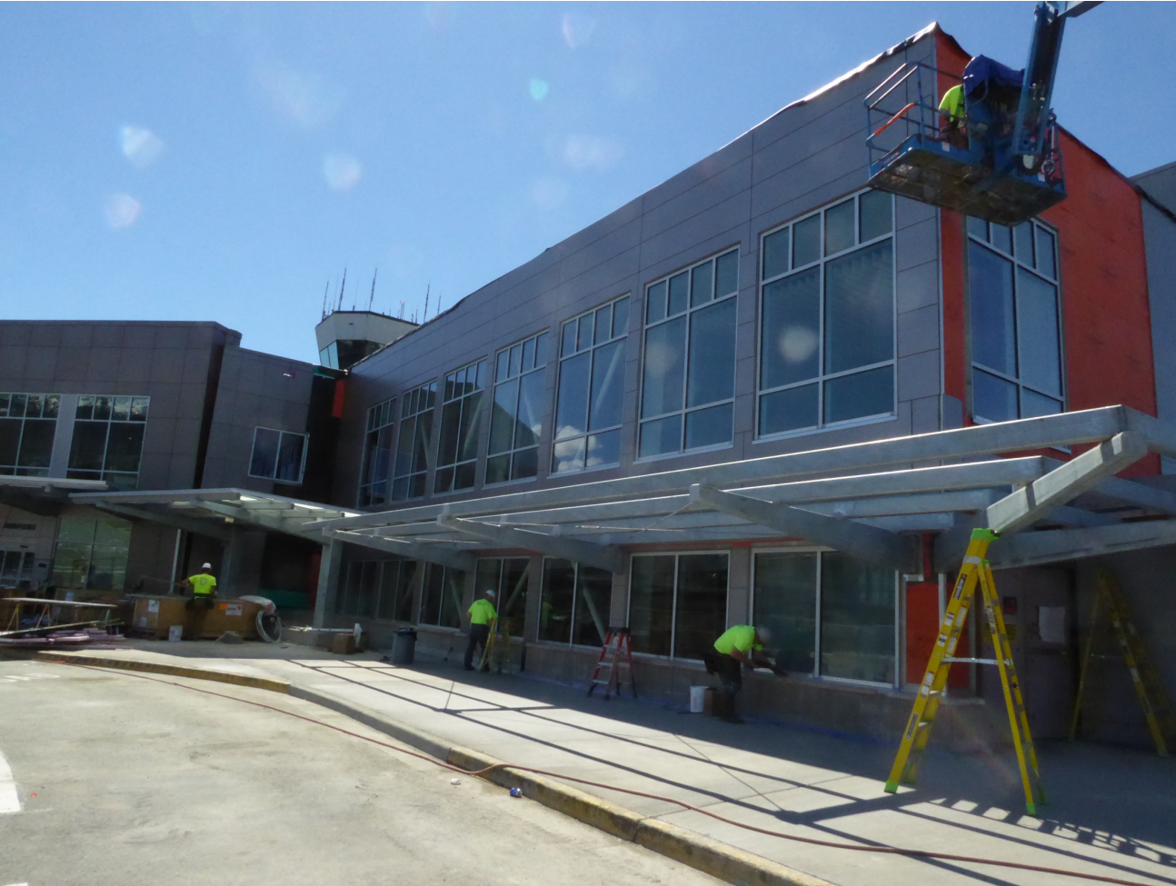
Terminal reconstructed east view from Shell Simmons Dr. with Dri Design siding panel install.