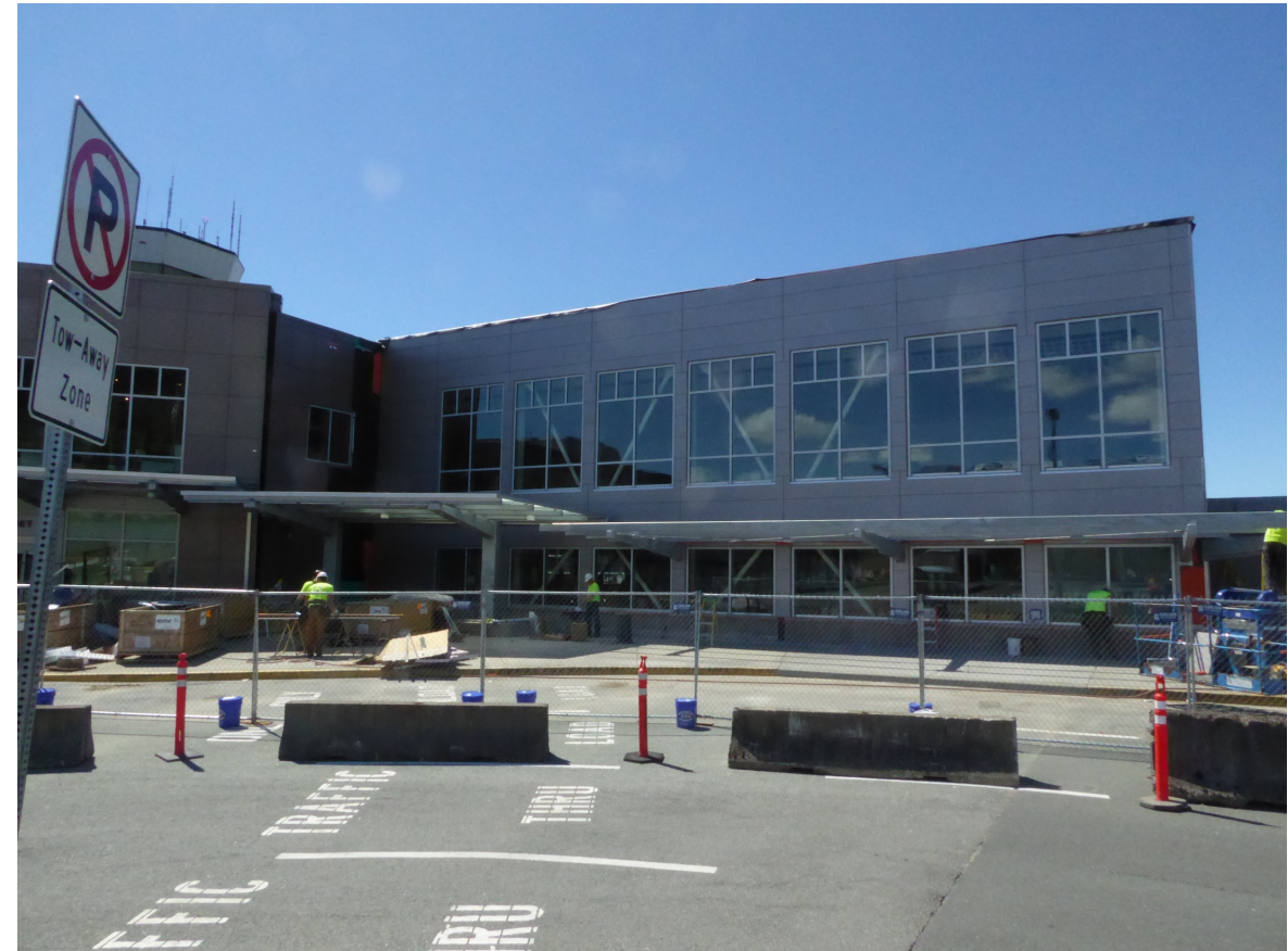
Note: temporary pedestrian walkway for passengers transitting between main terminal – north annex along roadway (jersey barriers).