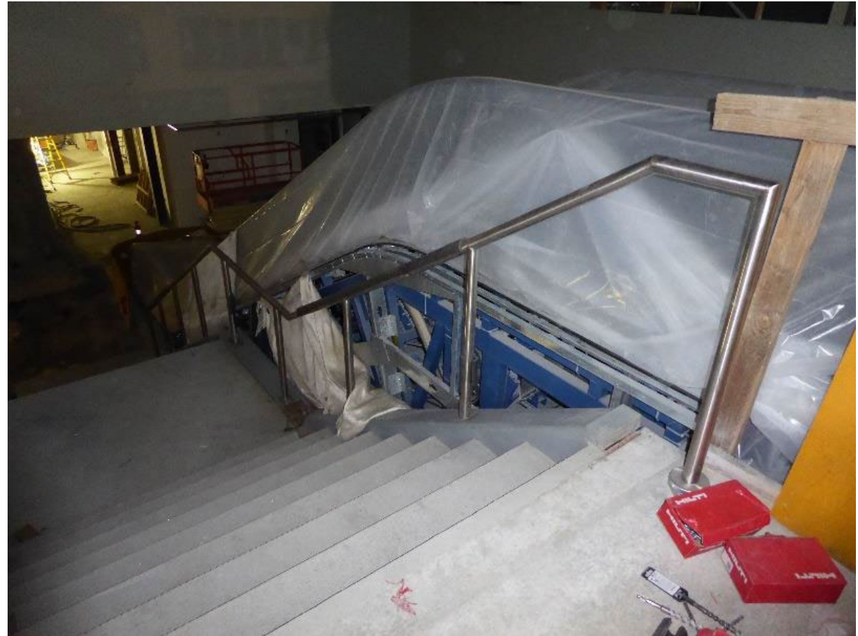
Railings placed on stair tower landing; and main stairway handrail mounted.