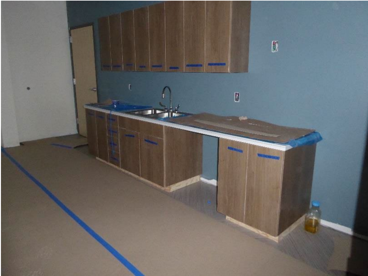
Admin break room casework install.