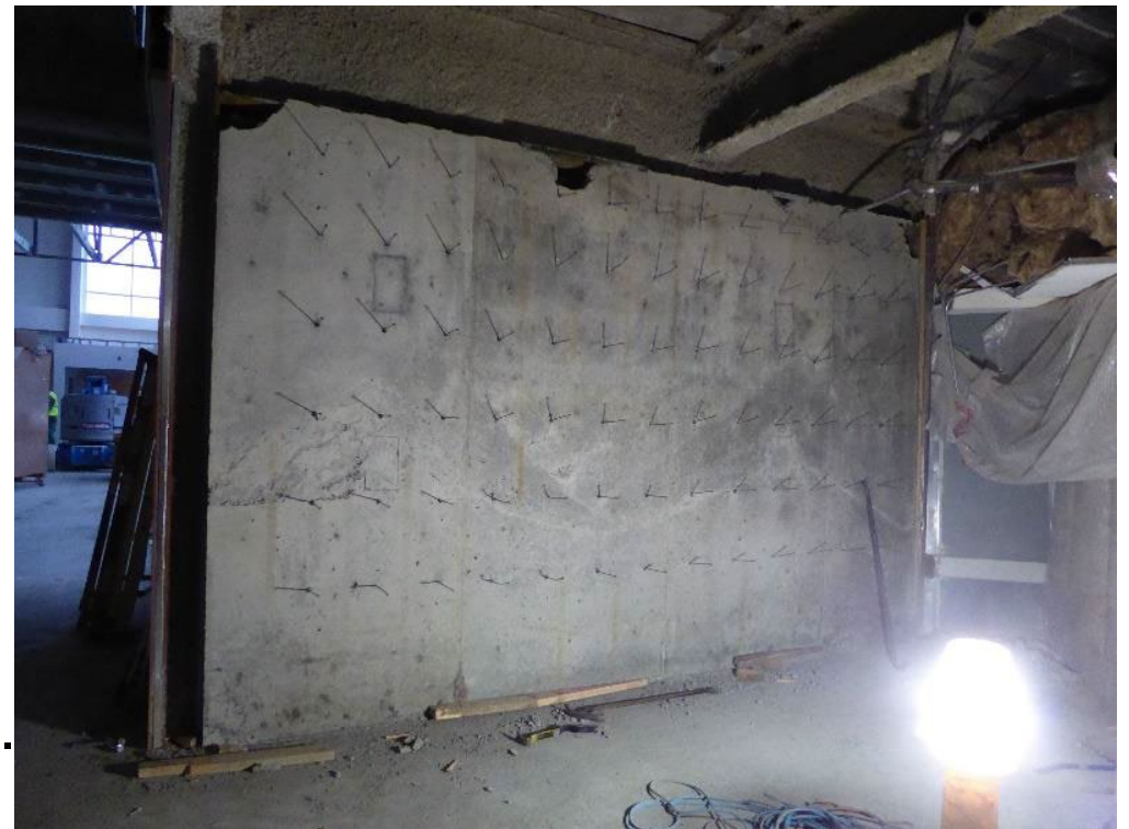
North concrete shear wall poured.