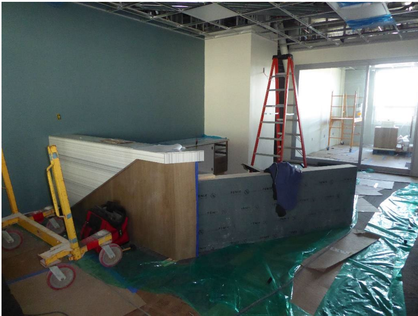
Airport Admin reception casework being assembled.