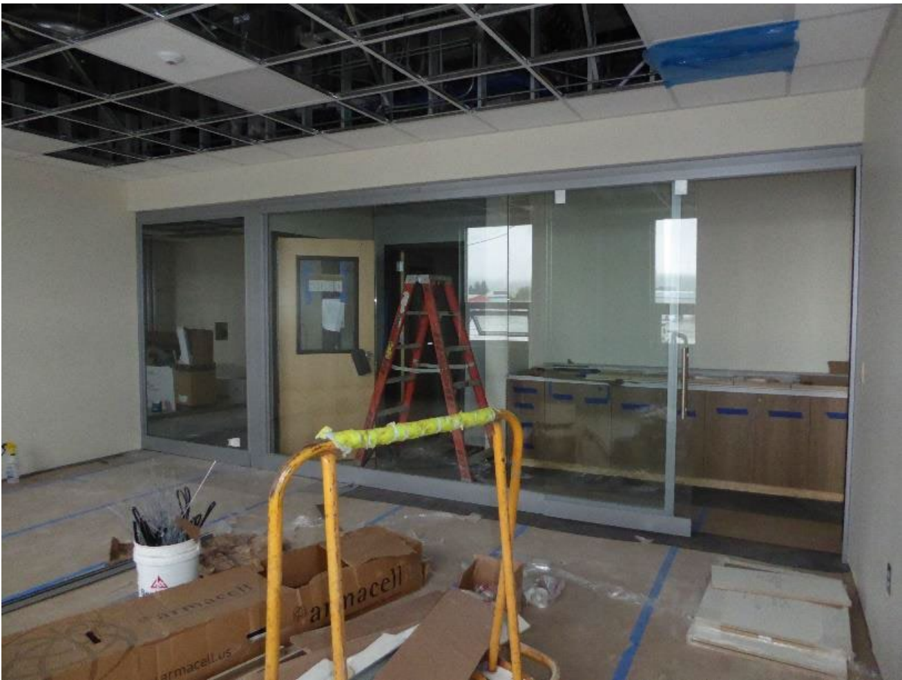
Airport Manager's office glass wall partition (hallway).