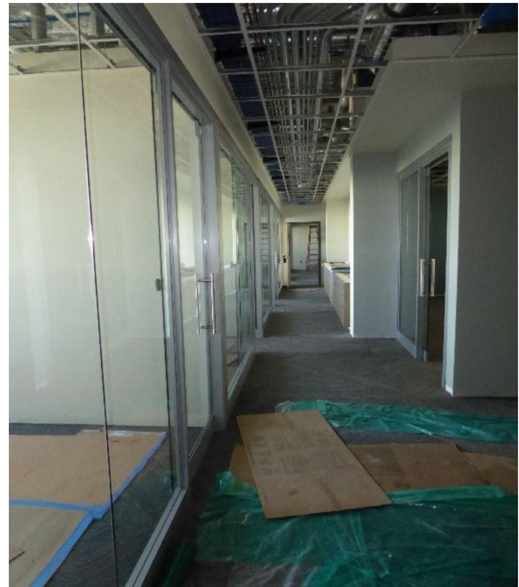
Airport Admin suites hallway.