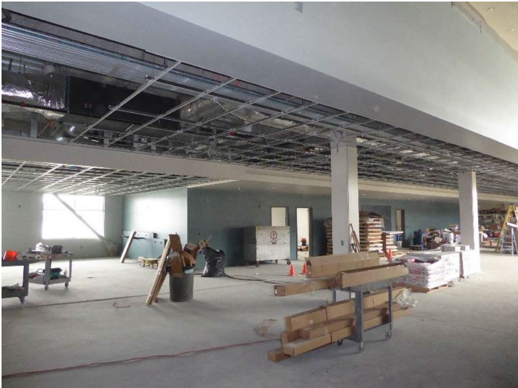
Ceiling grid installed in 1st floor ticketing / queuing areas.