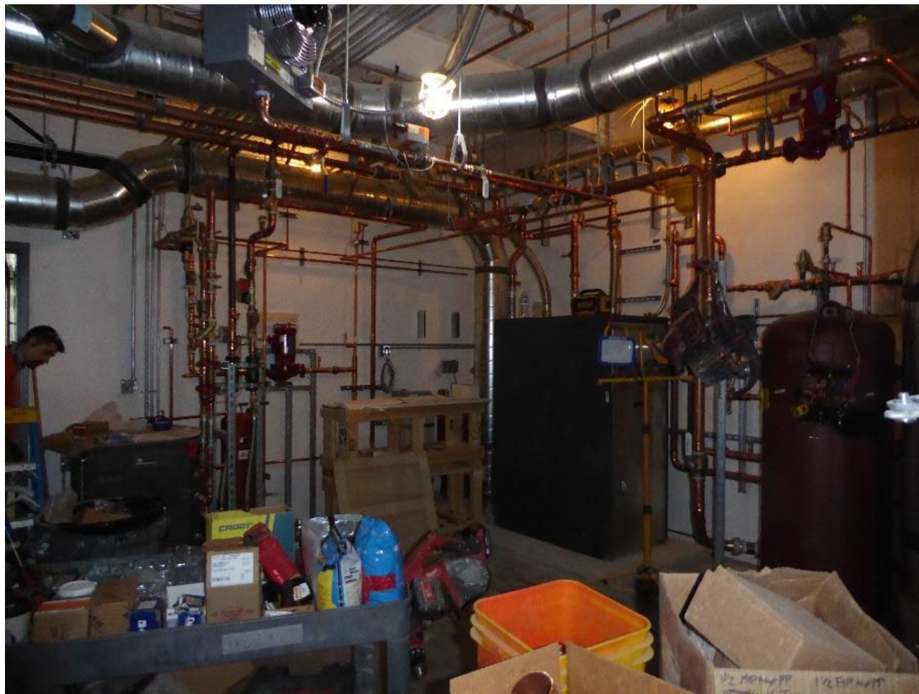
Equipment installed in penthouse mechanical room.