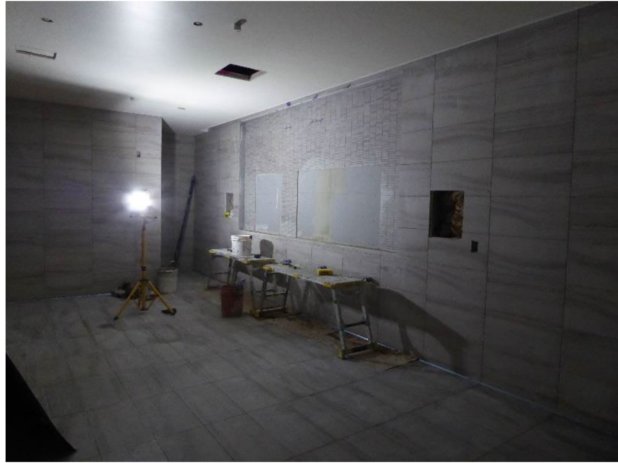
Floor and wall tile installed in 1 st Floor Men's and Women's toilet rooms.