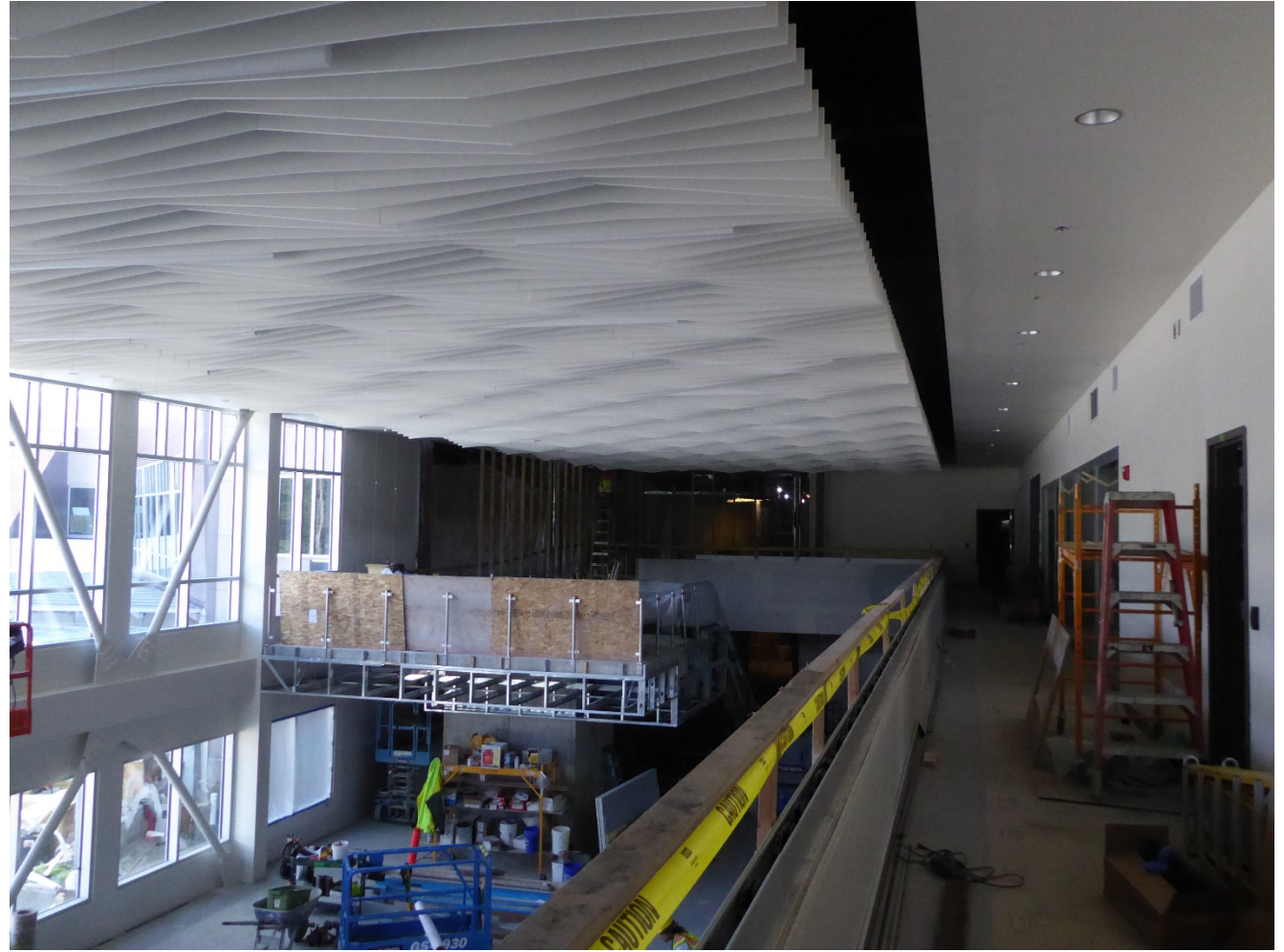
Arktura ceiling framework with lights installed in high ceiling area; views from below and balcony