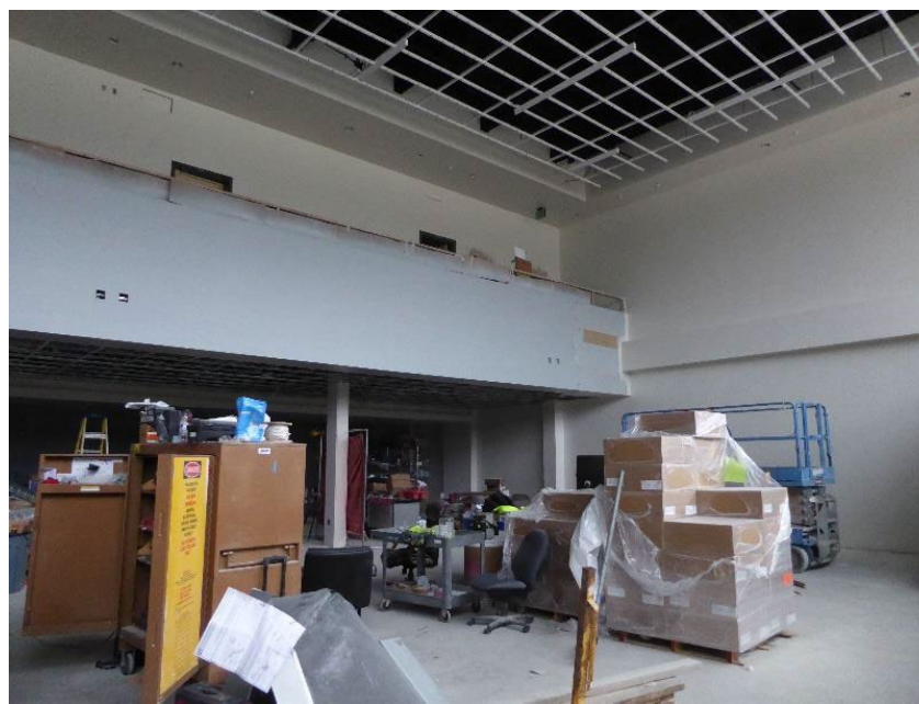
Balcony railing painted; view from seating area.