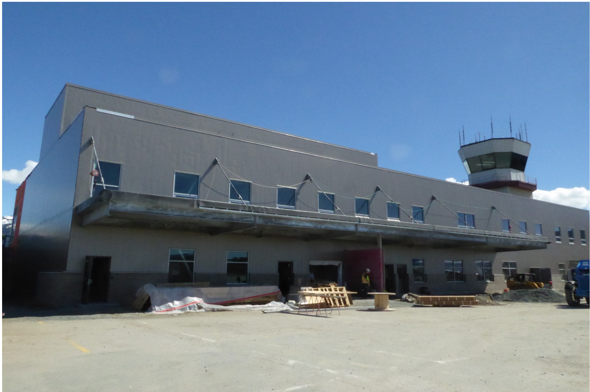
Siding and canopy installed on west (ramp) side.