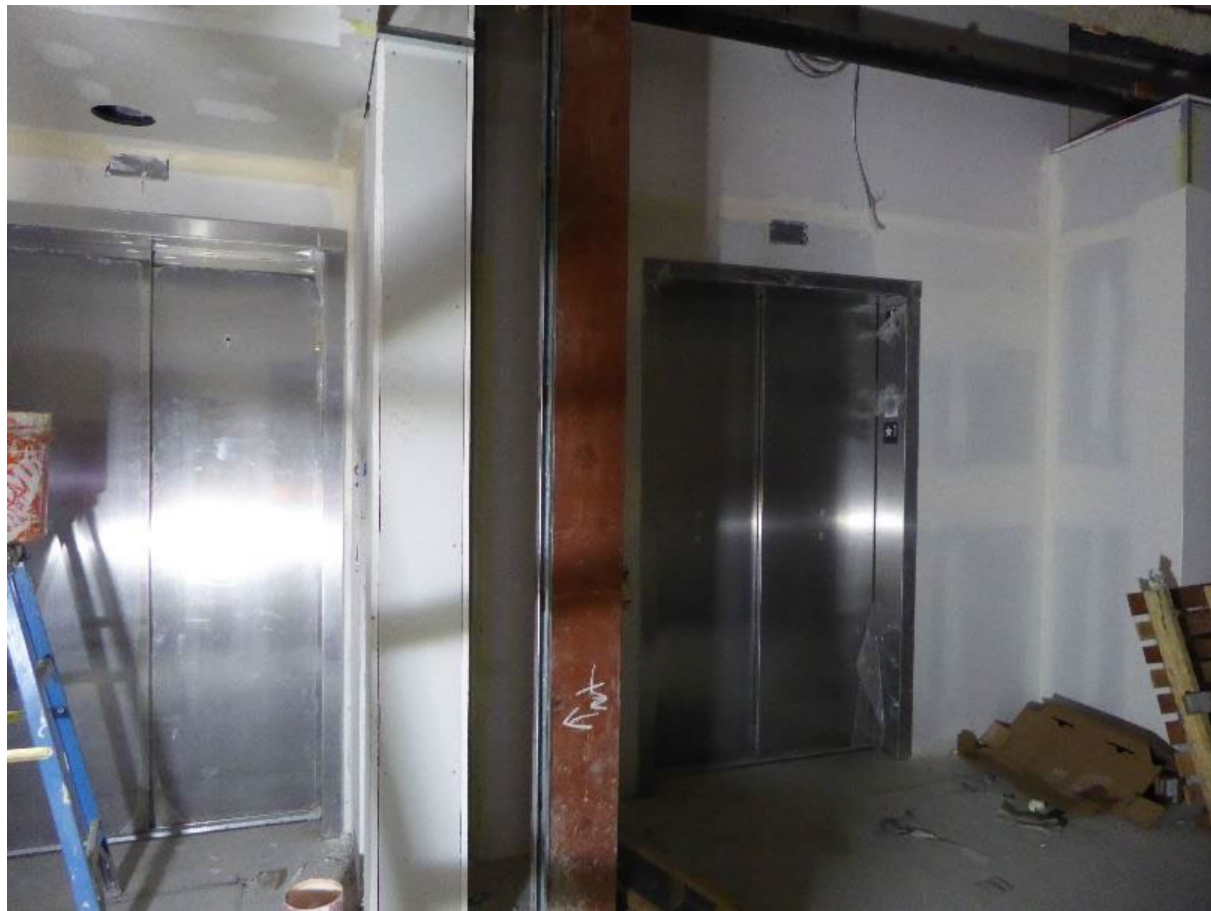
1st floor elevator lobby.