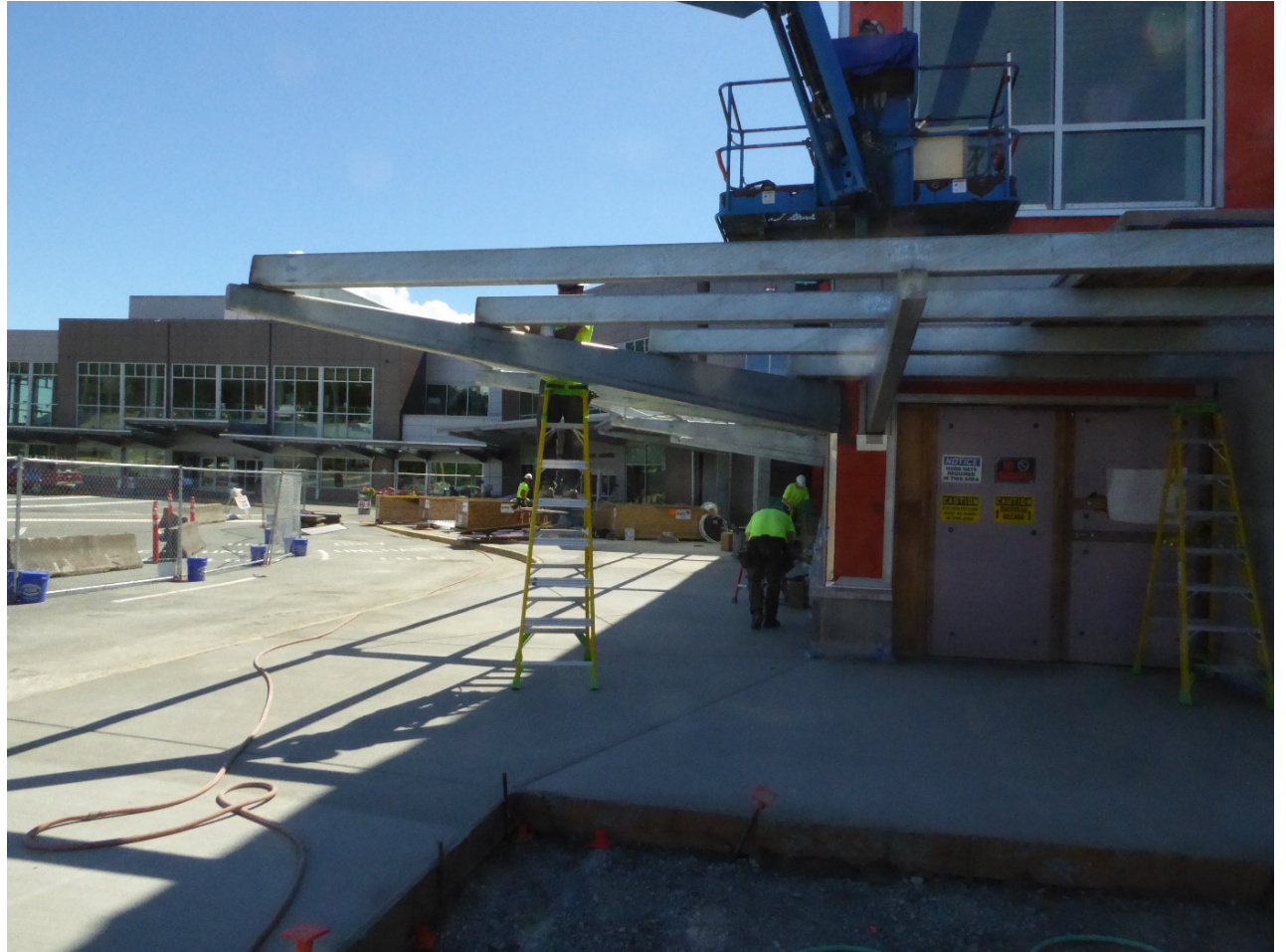
Terminal reconstructed north side entry vestibule and siding panels install.