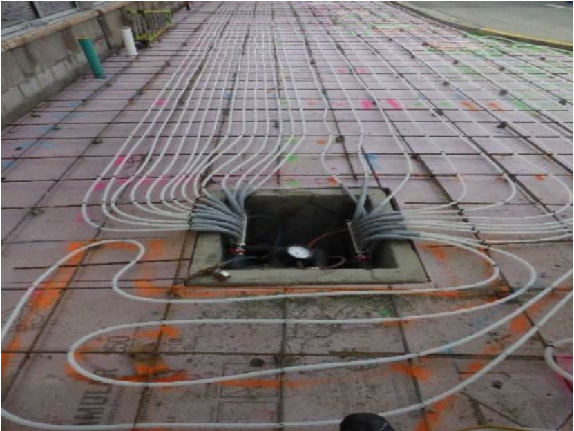
Snowmelt sidewalk prepped with vault, insulation, rebar and heating tubes.