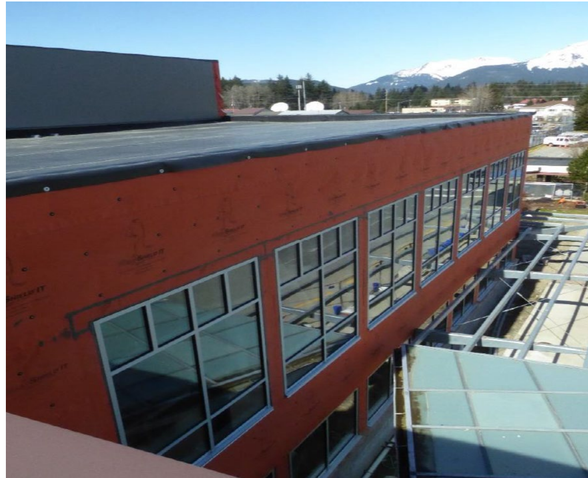
Terminal (front) building viewed from existing roof; sidewalk canopy frame also in view.