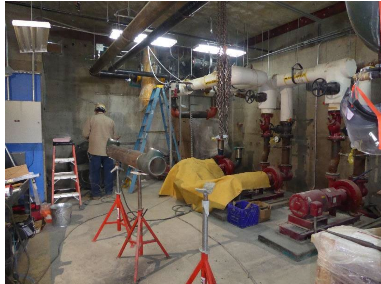
Ground source heat piping install in pump room.