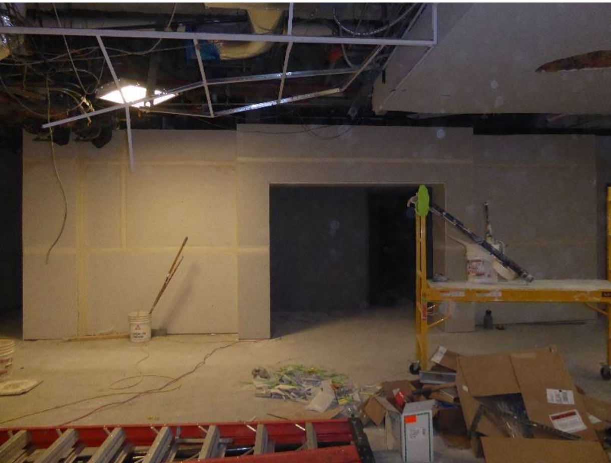
1 st floor toilet room entrance.