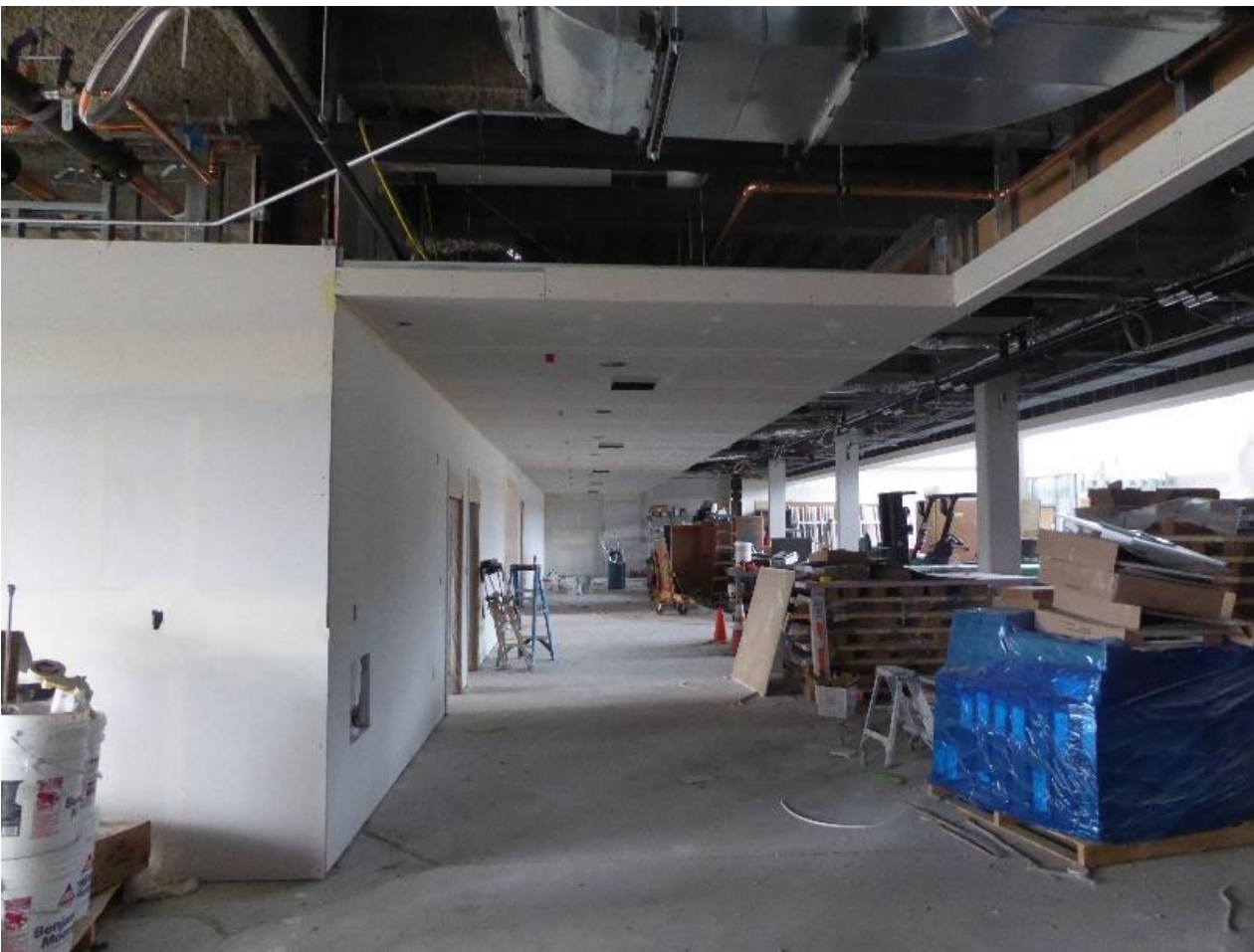
Ticketing area; small carrier.