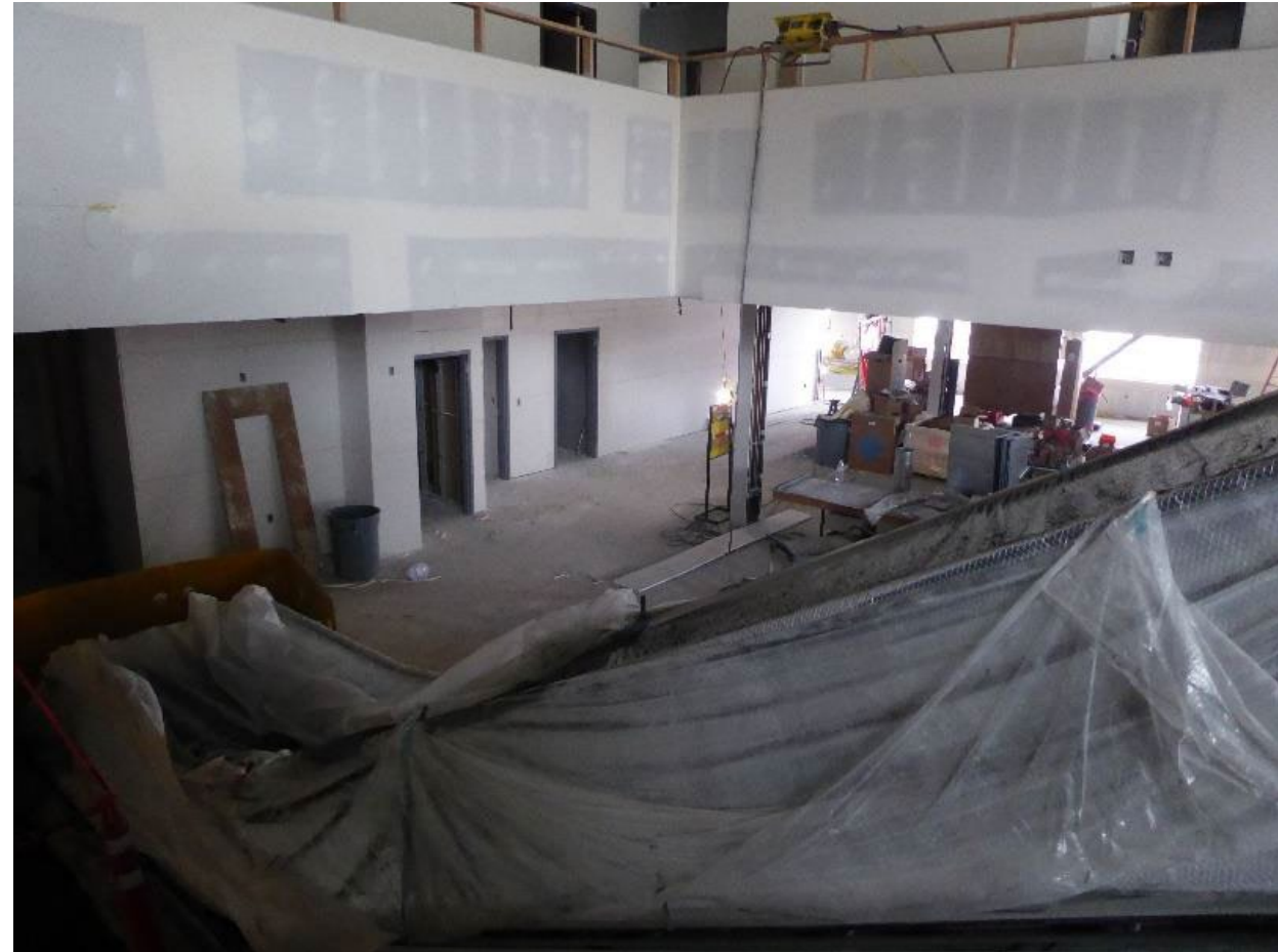
View from ramp of stair, escalator and seating area.