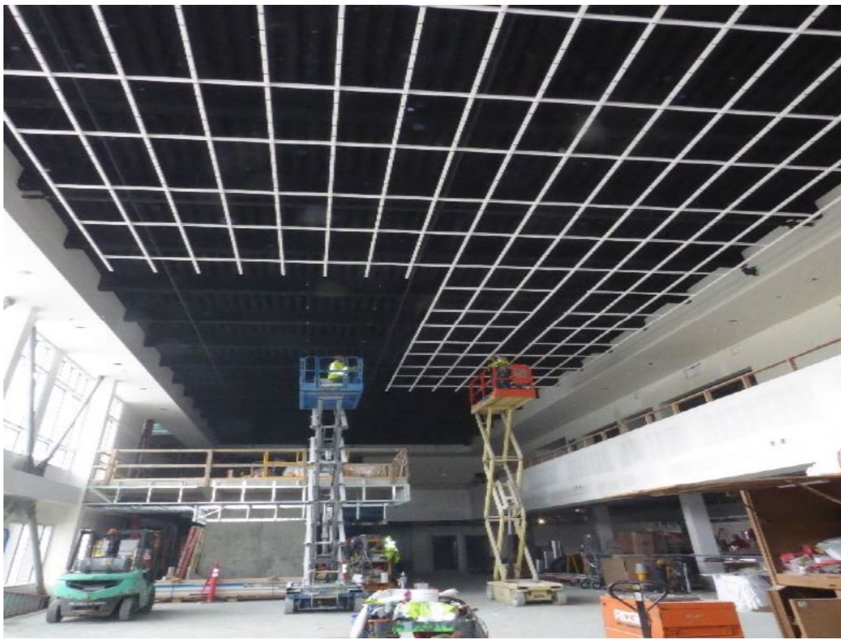
Arktura ceiling framework being installed above seating area; view of ceiling, seating, stairs from balcony.