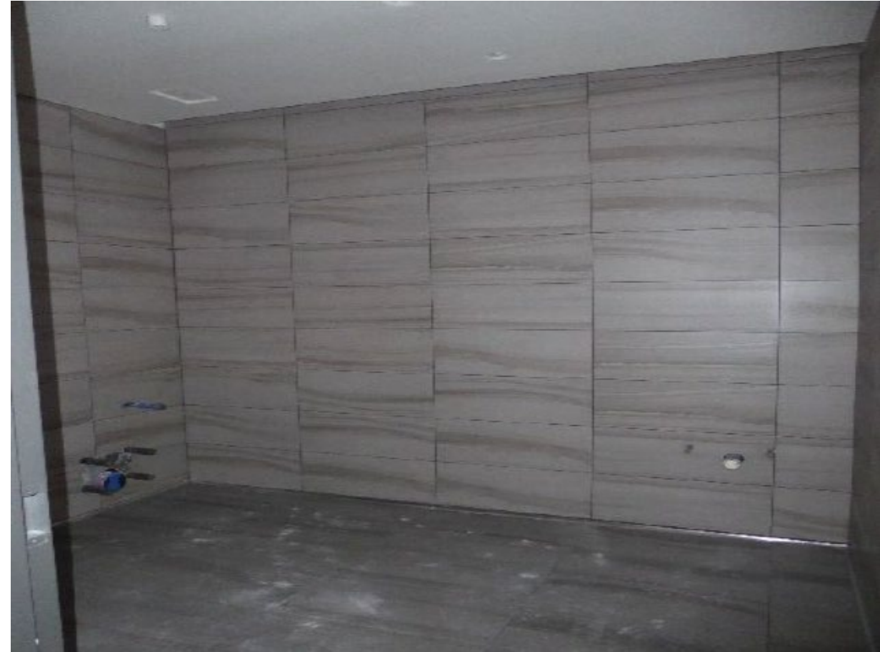
Tile installed in toilet room.