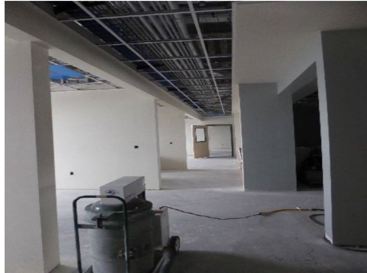
Drywall installed in Customs Suite; Airport Admin. hallway.