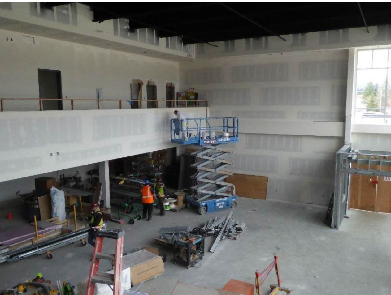
Balcony railing wall drywall completion.