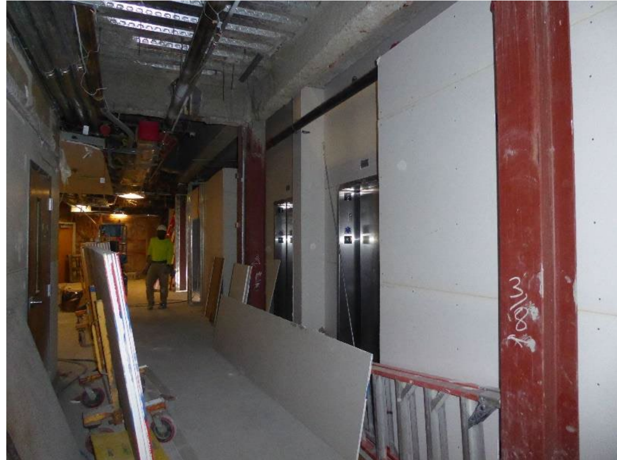
1 st floor elevator entrances.