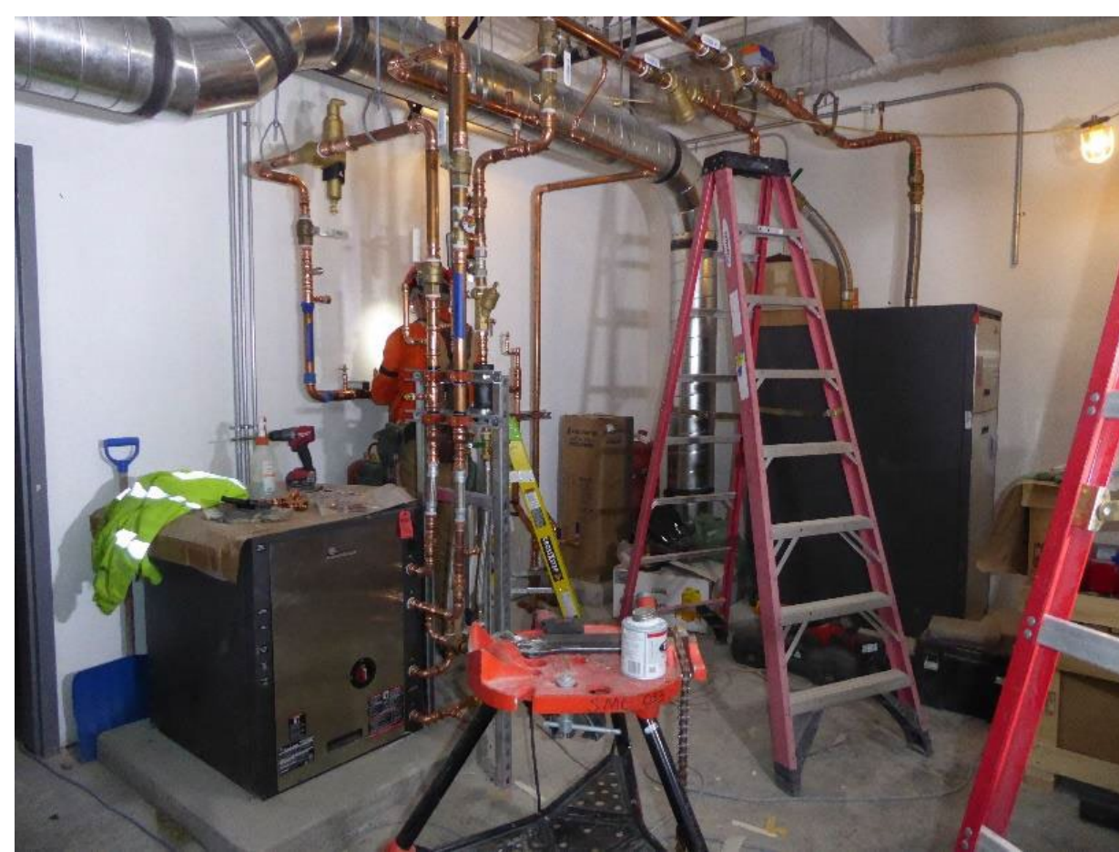
Equipment install in penthouse mechanical room.