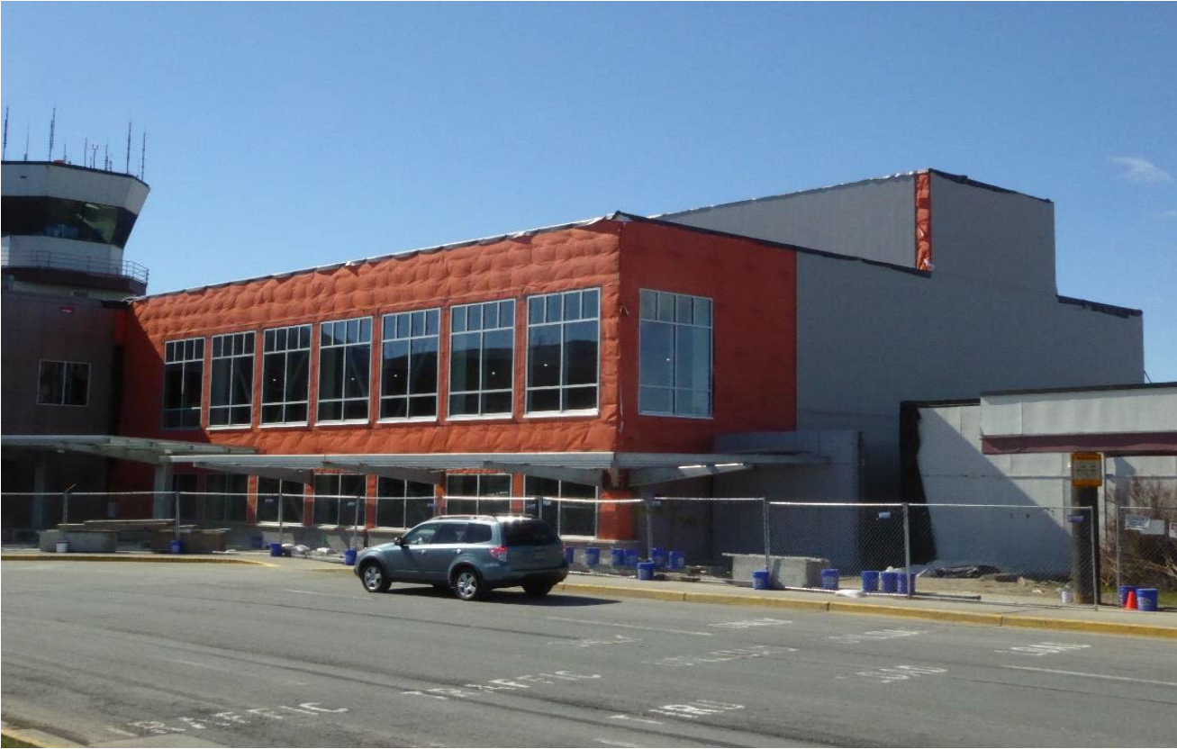
Terminal reconstructed building's east side viewed from Shell Simmons Drive.