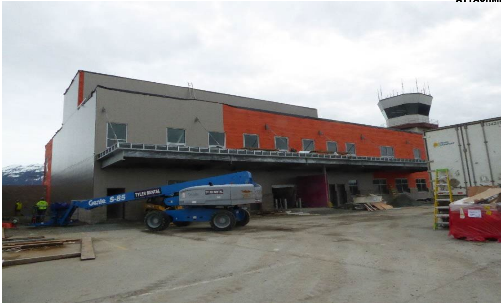
Siding installed on north and west (airfield) sides.