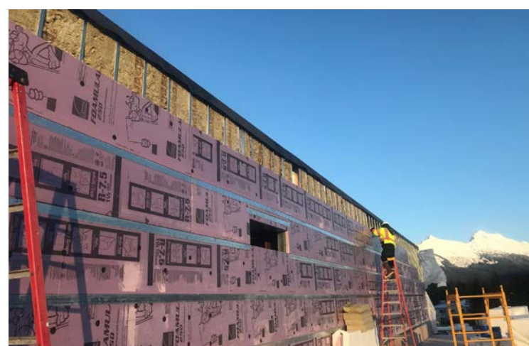
Installing insulation and z-girts on the penthouse exterior wall.