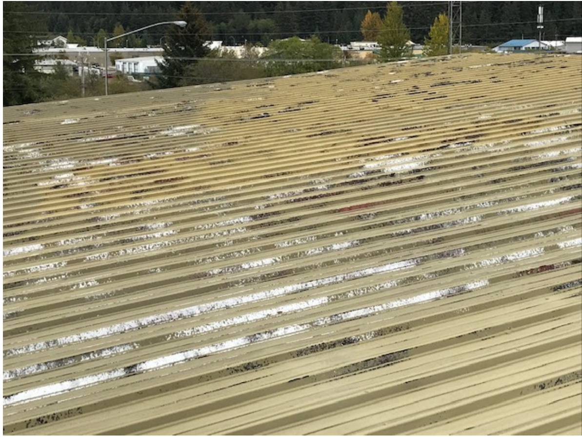
Information to Bidders JNU Sand Shed Demolition CBJ Contract No. BE20-187