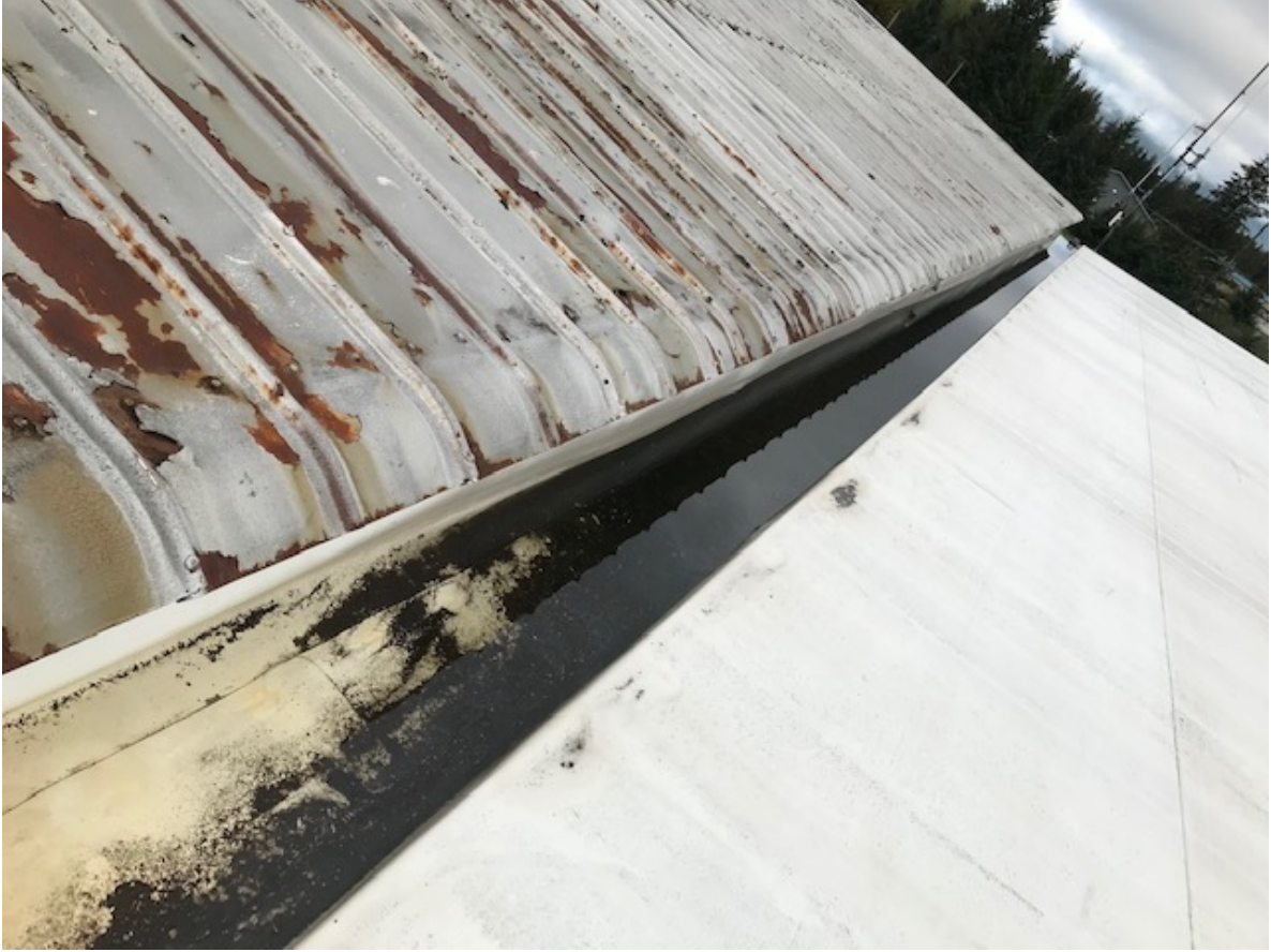
Information to Bidders JNU Sand Shed Demolition CBJ Contract No. BE20-187