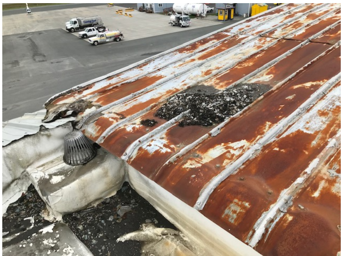
Information to Bidders JNU Sand Shed Demolition CBJ Contract No. BE20-187