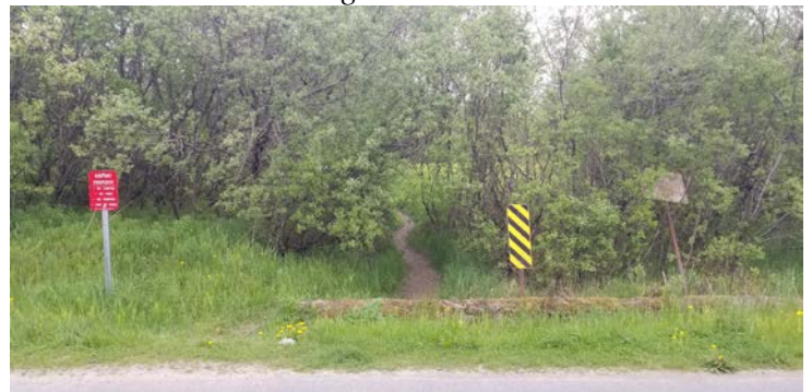
Jordan Creek trail overgrown