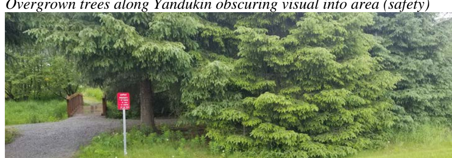
Overgrown trees along Yandukin obscuring visual into area (safety)

Trees along Yandukin limbed for visual (note: path side limbs were already trimmed)