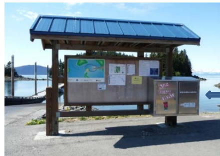
Kid's Don't Float

Last year, 533 of the 758 boating fatalities resulted from drowning, with 84 percent of the drowning victims not reported as wearing a life jacket. The Coast Guard is urging recreational boaters to make sure everyone on board wears their life jacket at all times on the water