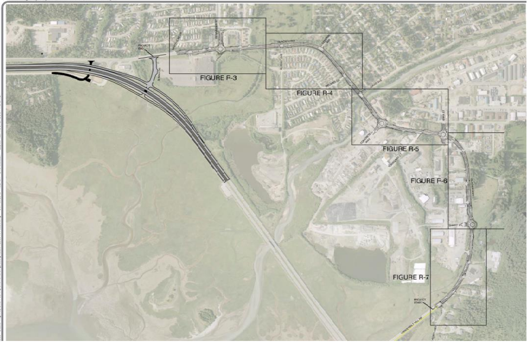
Glacier Highway: Bicycle & Pedesirian Improvement Project