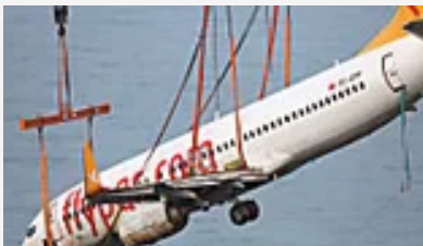
Turkey uses large crane to remove skidded plane from slope