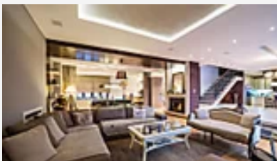
Anchorage Seniors. Check Out These Living Apartments