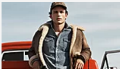
Stay Classically Cool This Winter In Ralph Lauren Menswear