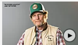
Matthew McConaughey's brother on naming children after beer