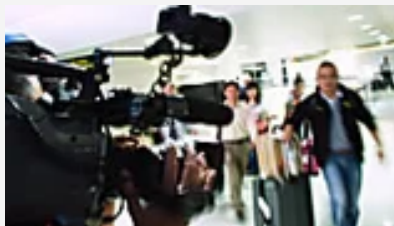
Reality show crew prompts bomb scare at Newark Airport