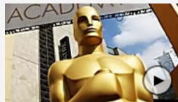
2018 Oscar nominations surprises and snubs