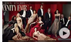
Oprah, Reese Witherspoon have Photoshop fails in Vanity Fair