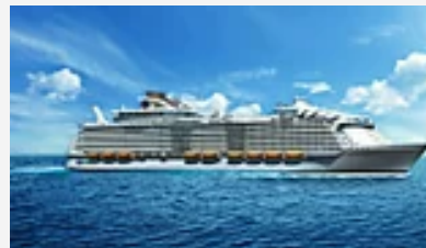
Luxury European Cruises Worth the Hype