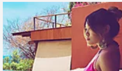
Millennials Are Using This Hack to Afford Travel