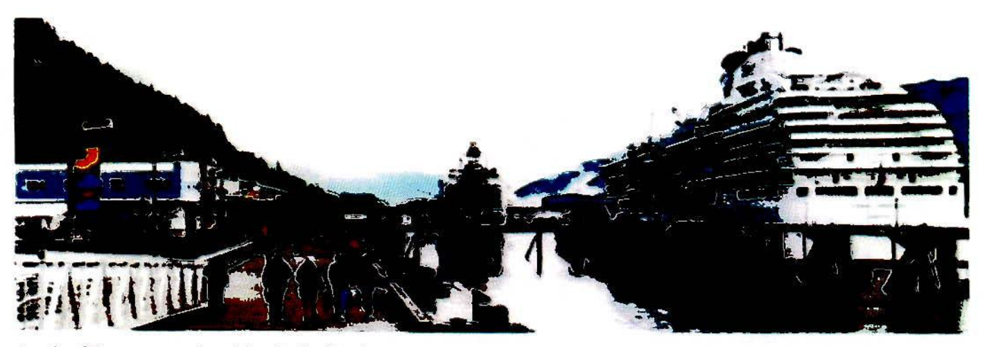
A pair of Panamax cruise ships docked in downtown Juneau on Aug. 30, 2017. This year will see even bigger vessels leading to questions over the community's capacity.