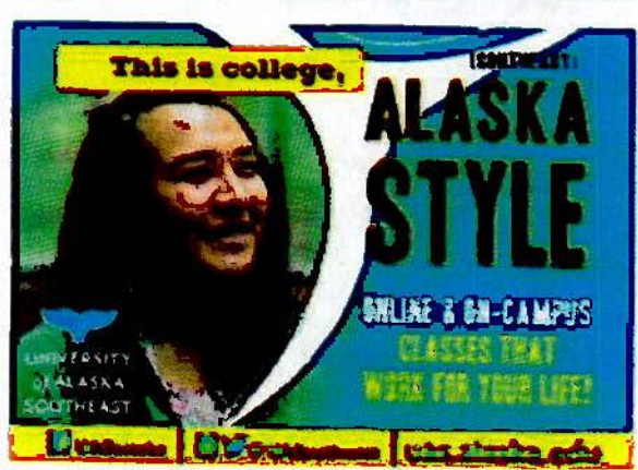
Exhibit MN Page 6 of 8