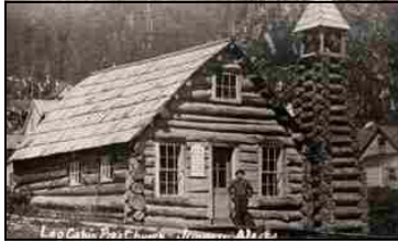
Northern Light Presbyterian Church JDCM 2002.12.002