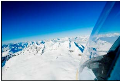
Image of Juneau Ice-field taken by Toby Harbanuk. Museum Purchase. JDCM 2009.21.