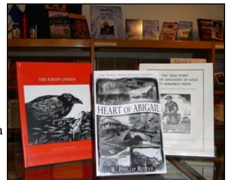
Some new arrivals at the Museum Store.