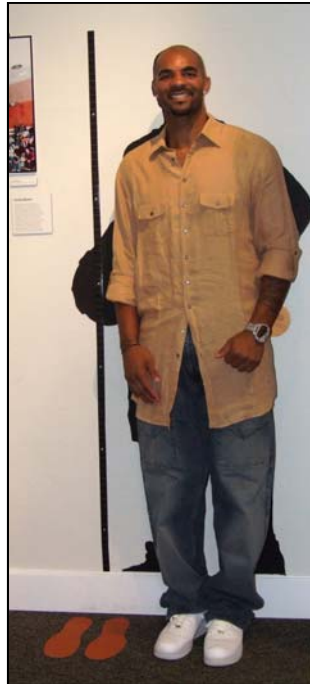
Carlos Boozer poses in front of his silhouette in the Hoop Time exhibit at a reception following the dedication of the Zach Gordon Youth Center basketball court on August 6th.

Hoop Time: Gastineau Channel Basketball Through the Years continues to be a success!