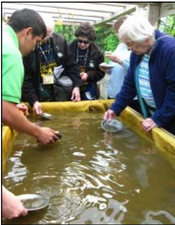
City Museum volunteers panning for gold on the AG Mill & Mine Tour.

A big thank you to all of our fantastic volunteers for their friendly, helpful service this summer! We especially appreciate our volunteers during the busy summer months and our visitors do too! Many of them mention how tickled they are to meet and talk with long-time local folks, and our volunteers' expertise in local culture and history is absolutely invaluable!