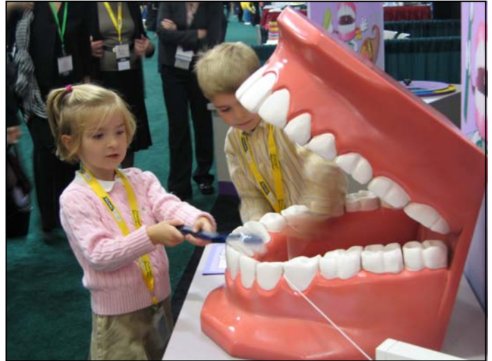
A young girl & boy practicing proper brushing & flossing techniques with one of the interactives from Mouth Power .

In addition to their combined exhibition, Hanes & Lee will be offering workshops on beading and felting in December, so be on the look out for details later this fall!