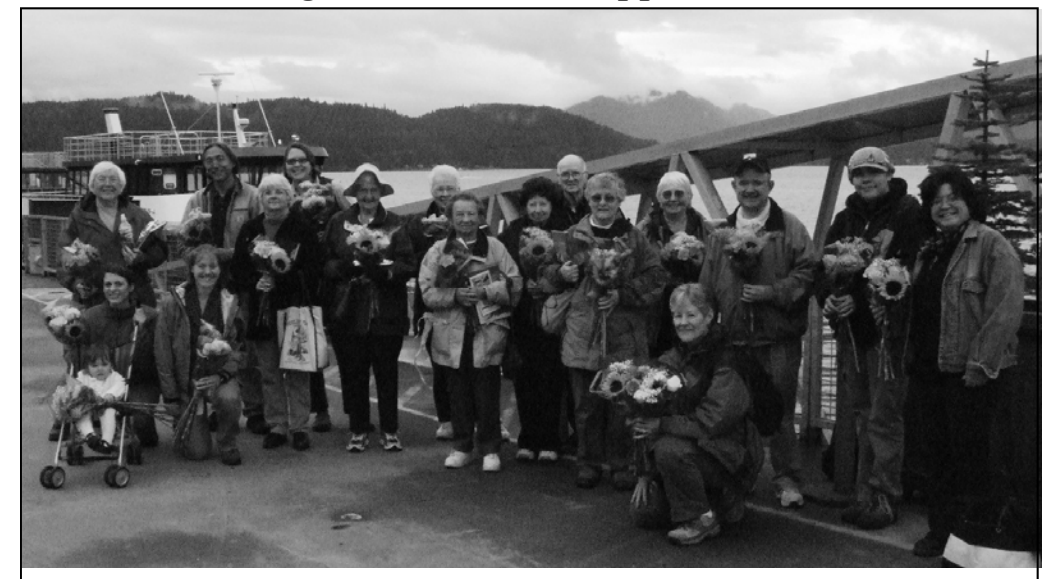
Volunteers & Museum staff on the Allen Marine Dock following an afternoon of whale watching.

As one of our busiest seasons ever comes to a close we are reminded of just what an integral part of the Museum our volunteers are. Volunteers not only welcome visitors to the Museum, but also assist with historical research, data entry of our collections and also serve on the Historical Resources Advisory Committee and much more. This year, volunteers donated 1,940 hours! As a small token of our gratitude, we scheduled a whale watching tour for our annual volunteer recognition event and we certainly got our fill of whale and sea lion watching!