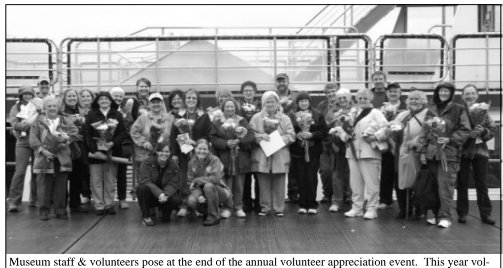
Museum staff & volunteers pose at the end of the annual volunteer appreciation event. This year volunteers enjoyed a whale watching tour to Orca Point Lodge - a small token of our gratitude for all of your hard work. Thanks so much !!!

The Juneau-Douglas City Museum would like to thank the following businesses for their generous donations to the annual volunteer appreciation event.