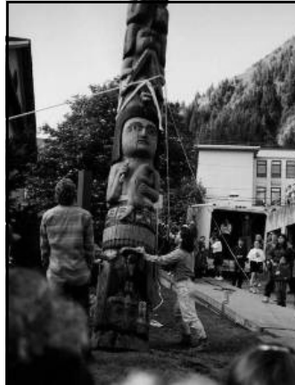
Four Story Totem pole being raised on June 4, 1994.

The totem will be removed from its mount and laid down in the museum's side lawn where it can be cleaned and allowed to dry. Laying it down will allow local school children the chance to see the entire pole up close. Keep your eyes peeled for educational opportunities for youths and adults alike! Haida carver Lee Wal-