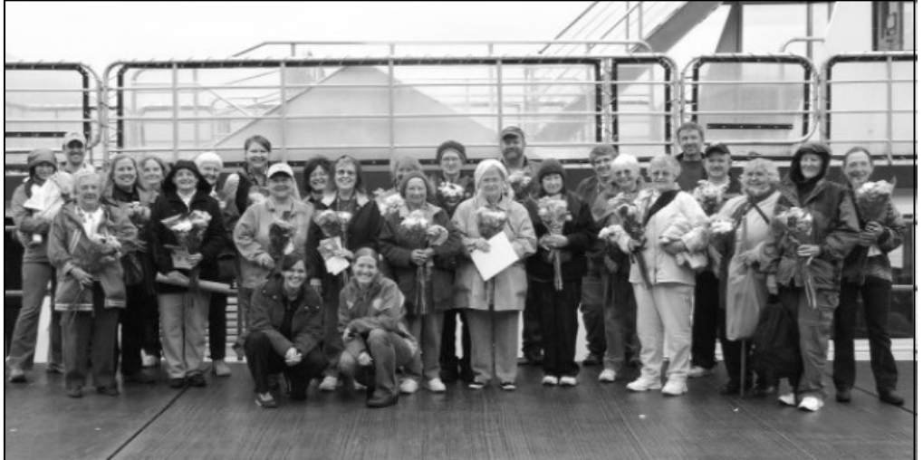
Museum staff & volunteers pose at the end of the annual volunteer appreciation event. This year volunteers enjoyed a whale watching tour to Orca Point Lodge - a small token of our gratitude for all of your hard work. Thanks so much!!!

The Juneau-Douglas City Museum would like to thank the following businesses for their generous donations to the annual volunteer appreciation event.