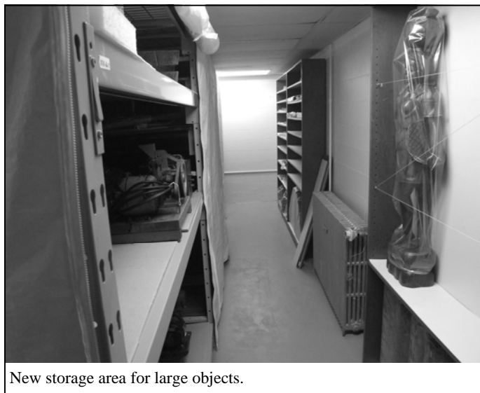
New storage area for large objects.

Built in 1951 as a library, it is no surprise that mechanical system deficiencies, particularly building overheating and lack of ventilation were of the greatest concern. Space deficiencies for collections storage and exhibit issues were also addressed. Lighting problems, lack of parking, limited street presence or "draw" and relatively high operating expenses due to energy