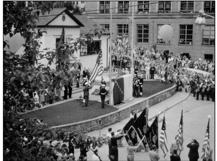
Raising the 49th Star Flag, JDCM88.30.007

On January 3, 1959, President Dwight D. Eisenhower signed the statehood proclamation making Alaska the 49 th state in the Union. It was the first state since Ari-