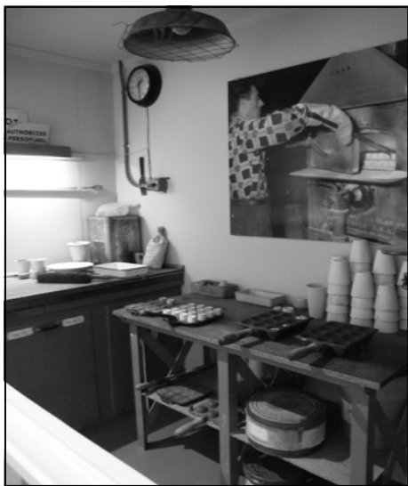
New Diorama of the Bureau of Land Management Assay Lab

With a number of new changes and several thrilling new exhibitions, this summer season is sure to be a hit!