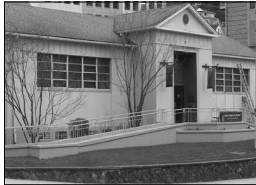
Museum Front Cleared of Extraneous Brush

of the building, echo the original colors and also compliment the other buildings in the area. These colors have been approved by the Parks and Recreation Department and the Historic Resources Advisory Committee. If you would like to see the color