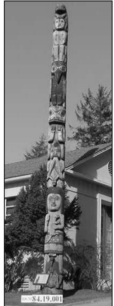
4-Story Totem Pole which will soon be restored

tional practices. Wallace will also present an overview of the stories represented in the Four Story totem pole.