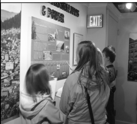
Floyd Dryden 7th graders research their projects in the museum

Over the course of the school year the students have selected topics, learned how to conduct primary source research, conducted oral history interviews, and learned how to edit digital media. The final project will be a compilation of the student's narration, interview clips, and historical photographs. These "digital stories" will then be put on display on two touch screens located in kiosks in the Politics, Personalities and Power gallery.