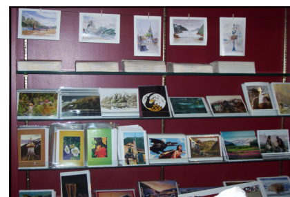
Featured Art Cards.