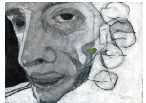
Flume-Memory painting by Rob Roys. Reverie Exhibition Opening January 4, 2013 until January 26, 2013.

In October 2012, the Museum was awarded an $8000 Alaska State Museum Grant-in-Aid to assist with a re-organization of the Museum's education collection. In a continuing effort to improve the quality of the Museum's educational programming, we will inventory, cull, and document our education collection in Past Perfect, our collection software. The grant will allow us to purchase storage cabinets and archival materials to rehouse the education collection in better and more efficient storage solutions. Our education collection is a different level of care than our permanent collection and has been established for hands-on learning and use. When this project is completed, the Museum will have taken a valuable step in reassessing its educational holdings so that we can begin to look at themes for education programs, history kits, and other educational opportunities.