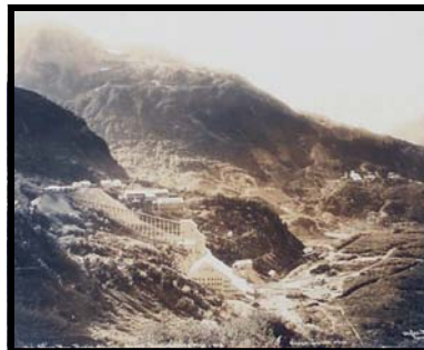
Photo: Silverbow Basin and the Perseverance Mine (now on display in the Rare and Early Mining Photos exhibit)