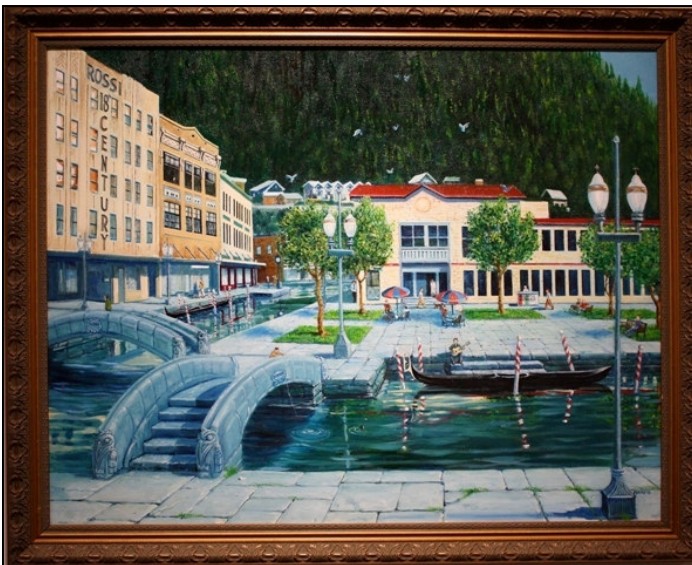
South Seward Street Serenade By Dan Deroux. JDCM2010.07.