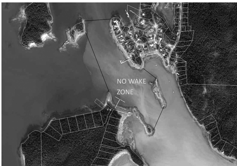
Reference Guideline #55—No Wake Zone—Smugglers Cove Area

Vessel Operators have agreed to limit public announcements to the greatest extent possible, to designated zones in Tracy and Endicott Arms, shown here in blue.