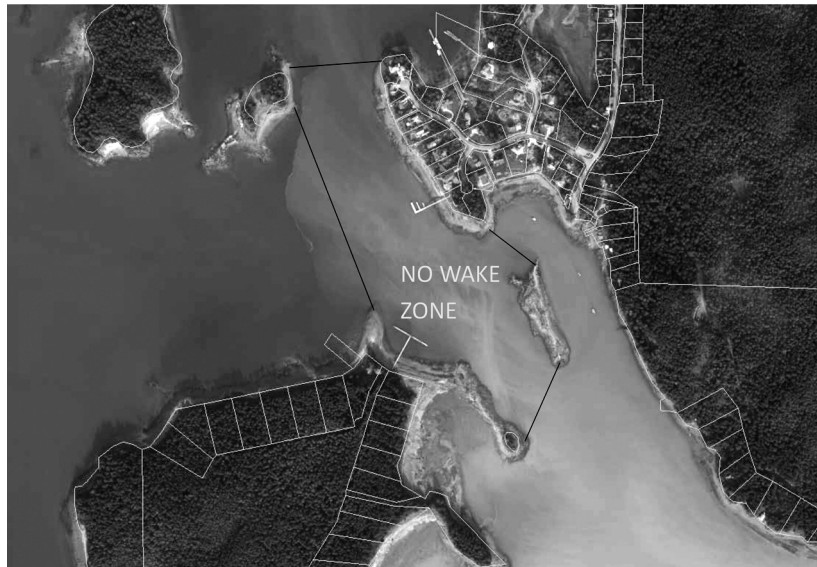
Reference Guideline #55—No Wake Zone—Smugglers Cove Area

Vessel Operators have agreed to limit public announcements to the greatest extent possible, to designated zones in Tracy and Endicott Arms, shown here in blue.