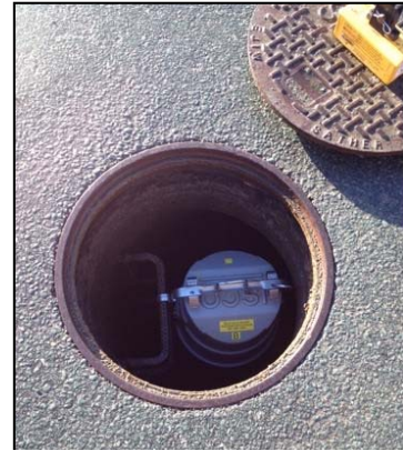
Photo of sampler inside a manhole.