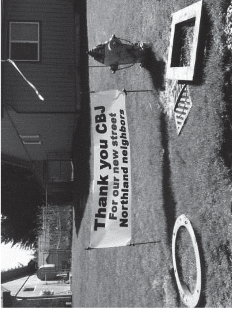
Northland Street Reconstruction