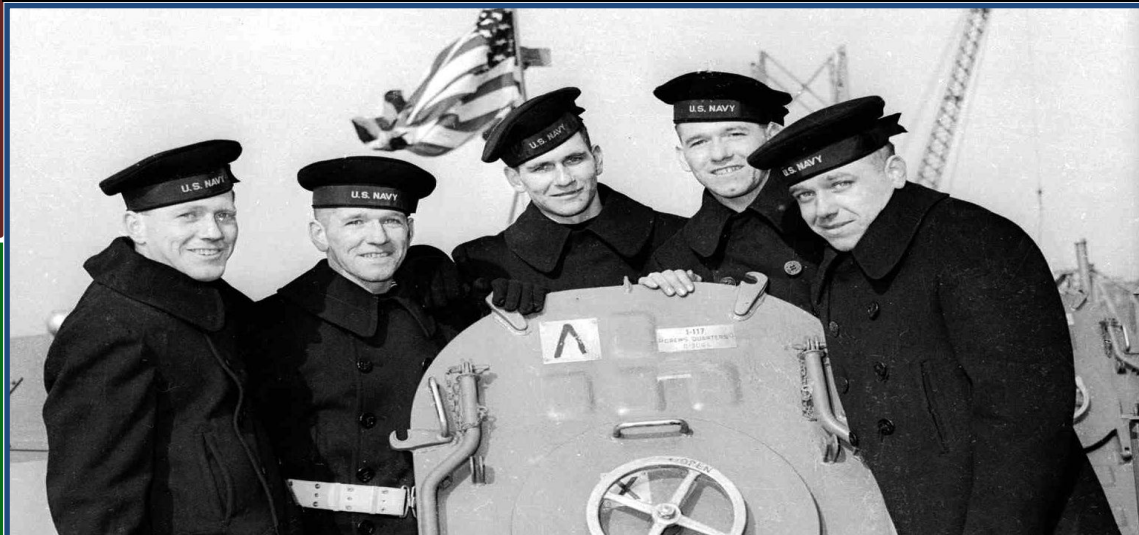
The five Sullivan Brothers Joe, Frank, Al, Matt, and George