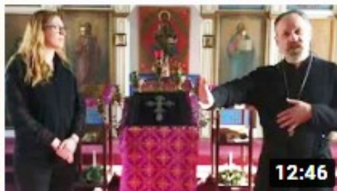
St. Nicholas Orthodox Church