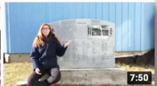
Unanga WWII Internment Camps Memorial