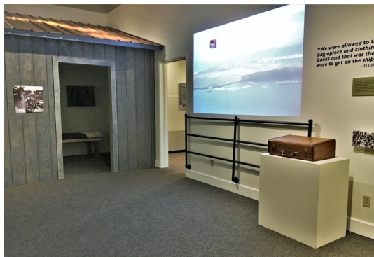
Murray Gallery exhibit detail.

Our special exhibit brings attention to the history of the Unanga̋ internment camps in Southeast, Alaska. It is the story of the people of St. Paul and St. George (the Pribilof Islands) who were interned in Southeast Alaska at Funter Bay on Admiralty Island from June 1942 to May 1944, and their subsequent return home to the Pribilof Islands. Telling this story in the words of those who experienced it, we aim to highlight this event and shed light on a topic that is often excluded from history books and school curriculums around the country.