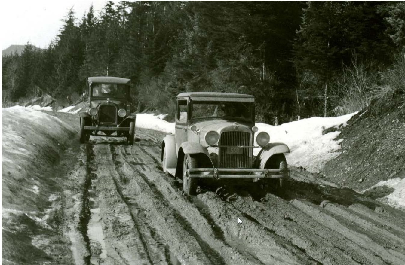
Old Glacier Highway Spring Thaw - 1932